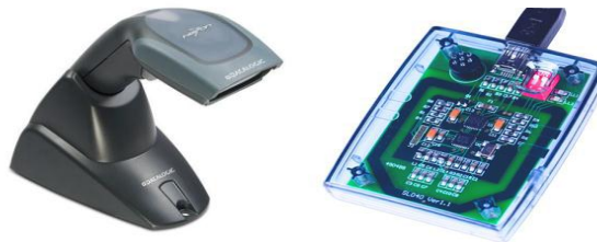
Figure 2. Two different types of reader: left one-barcode reader, and the right one is RFID-reader.

SCS reader requires to be separated from desktop computer, with Java and PostgreSQL installed in this desktop. Furthermore, connection to server's database is required to be established; however, it is not strict condition, as SCS reader module stores all data in text file.